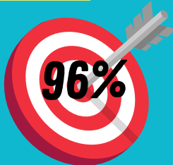
Attendance from September 2025

Did I help my class to reach our target?